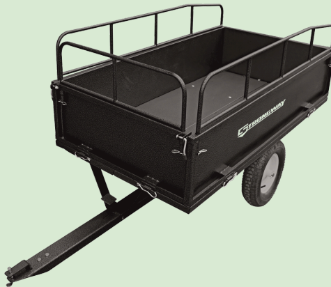
1 Utility Trailer