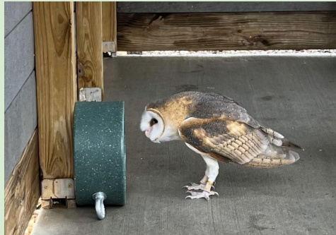
1 Looky Lou Mirror Enrichment