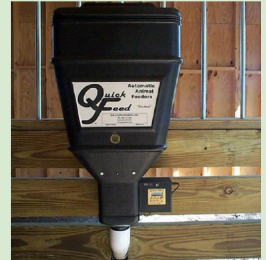
3 Timed Feeders for Bears