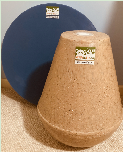
2 Topsy Tom Toys 1 Pill Disc Toy