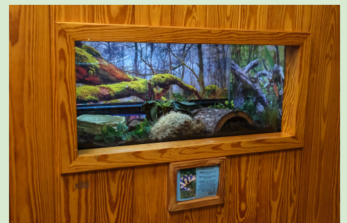
6 40-gallon Reptile Tanks