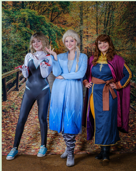
Costume Photo Booth Fundraiser at Bear Holloween