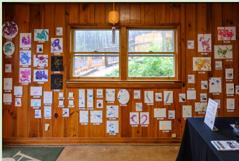
Zoo Day and Bears' Birthday sales of art made by zoo animals