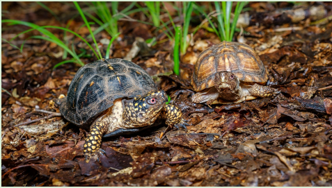
Turtle Habitat Flooring, Hides, Water Dish & Feeder