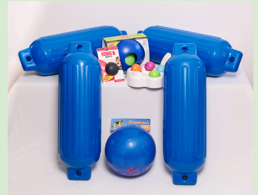
Enrichment Floats, Balls, and Feeder

Last year we set our sights on larger needs at Bear Hollow Zoo such as habitat improvements, and thanks to your generosity, we are starting to fulfill that promise. Some of the contributions we made this year were materials for behind-the-scenes upgrades, so you may not see them when you visit the zoo, but they were very much needed and are appreciated! Thanks to you, our supporters, the turtle habitat flooring in the viewing area behind the reptile house windows will now be easier to maintain and last longer. The new mesh panels in the bears' night area will allow greater visibility for staff to observe the bears, more training opportunities to enhance their care, and more locations where enrichment items may be hung. We are excited to complete this Phase 1 of Operation NAP for the bears, and, with your continued support, we look forward to being able to supply an automatic watering system and permanent den boxes for the bears. Year-end enrichment gifts included a variety of items that float, roll, and stimulate curiosity and foraging behaviors. We hope that you may see some of these items in use as you enjoy a day at the zoo.