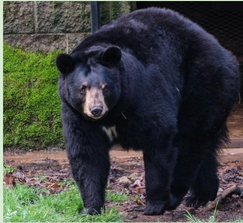
Bear Night Area Mesh Replacement