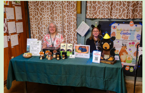
Sales of animal-made art and FOBH merchandise at Bears' Birthday and Deck the Hollow